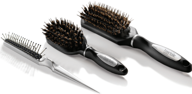
HT222 sectioning brush

5" long with rounded hook for a gentle and easy application.