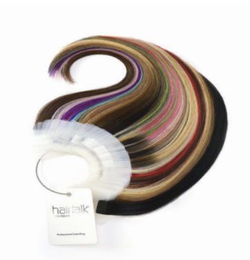
HT155 professional color ring

All swatches are 100% Remy Human Hair. Note: hairwear is only available in the colors mentioned in the guide.