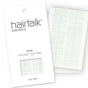
HT159 hairwear tape tabs

All swatches are 100% Remy Human Hair. Note: hairwear is only available in the colors mentioned in the guide.