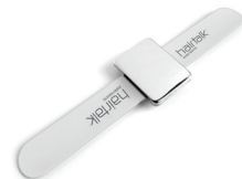
magnetic wristlet HT710

This medical-grade marker is perfect for marking the beginning and end of each weft row.