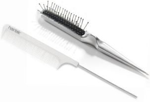
sectioning brush HT222 white rattail comb HT223

Ergonomically designed, the Sectioning Brush and White Rattail Comb are key tools in precision sectioning when applying extensions.