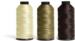
nylon thread HT709 | 4 oz. 1400m

These 3mm Silicone Lined Beads create a secure, safe, non-slip foundation for all weft extensions applications. Choice of: Light, Medium, Dark