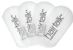
hair grippers HT215 | 4 pieces per pack

Ergonomically designed, the Sectioning Brush and White Rattail Comb are key tools in precision sectioning when applying extensions.